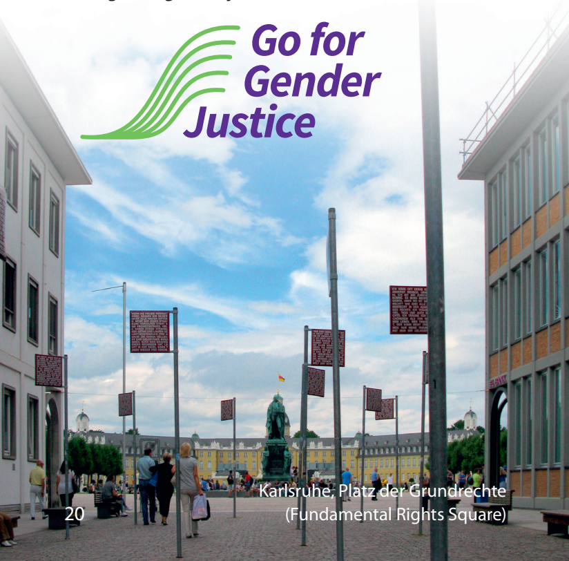
Karlsruhe; Platz der Grundrechte (Fundamental Rights Square)